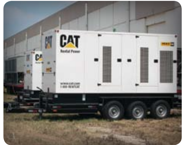
HOLT CAT portable generators provide the power for the evacuee shelter.

The HOLT Power Systems team arrived at the warehouse building and within 48 hours, everything was set up and running. Over Labor Day weekend, more than 2,000 evacuees poured into the center. While not luxurious, the building provided shelter, and thanks to HOLT, relief from the sweltering temperatures in the mid-to-upper 90s.