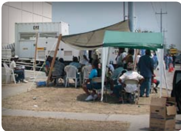
Katrina evacuees register for housing at Kelly USA in San Antonio.